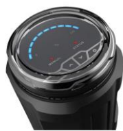
M1 Modulating Controller