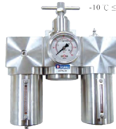
*Lubricator oil (Recommended): ISO-VG32

CE Ex II 2G Ex h IIC T4 Gb II 2D Ex h IIC T135°C Db -10 °C ≤ Ta ≤ 70 °C